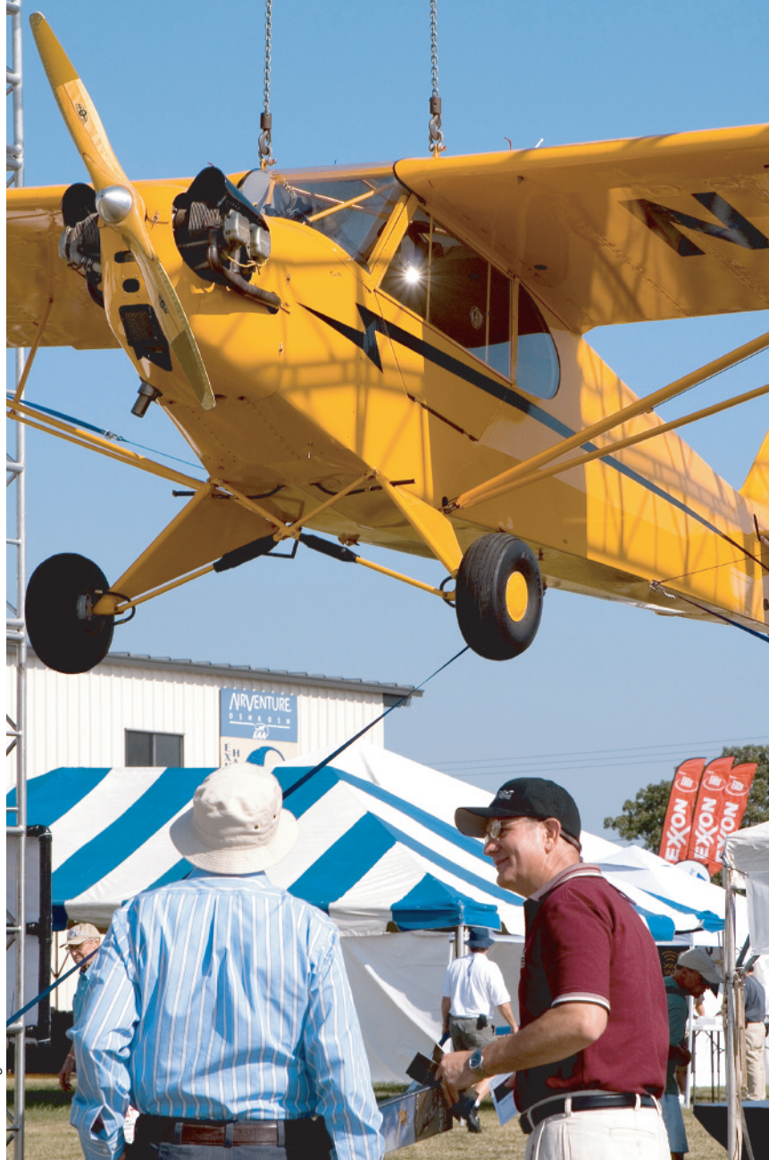
An "American Legend Cub" was suspended in air at EAA AirVenture-Oshkosh to promote the release of the film "One Six Right."